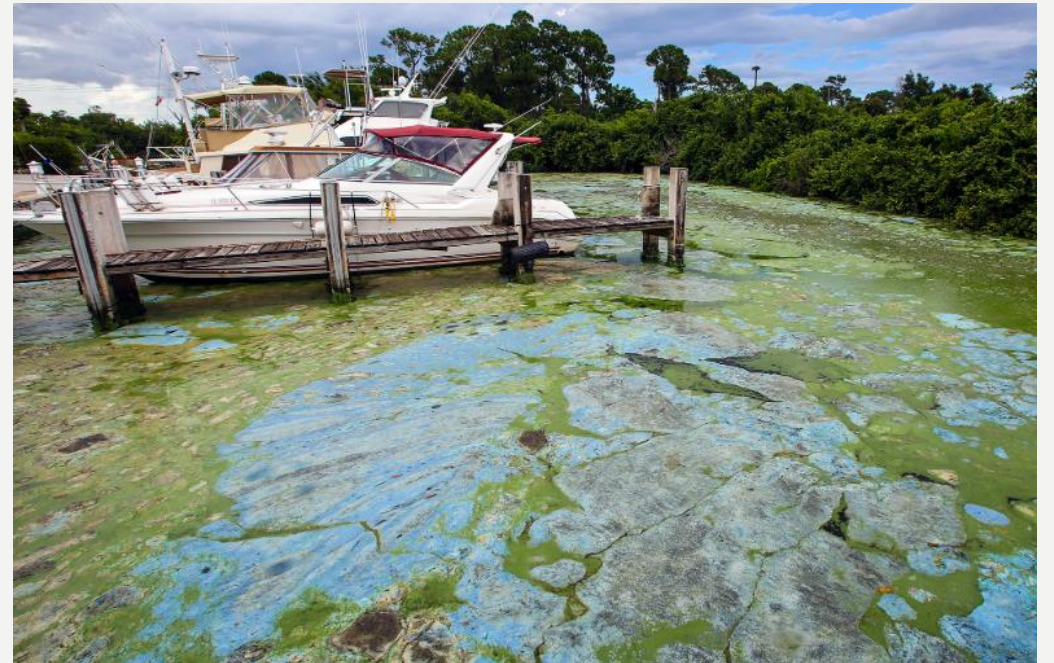
Blue-green algae due to Lake Okeechobee discharge and run off.